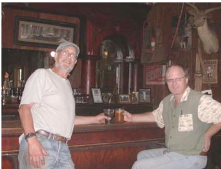
The 2009 Acorn Counters Anonymous Convention at the Pozo Saloon.

After our stop in Greenfield for lunch, we went on down to Pozo only to discover an almost complete absence of acorns. What to do? The obvious answer was to get a drink at the Pozo Saloon . Although only open on weekends, it's embarrassing not to have stopped here during any of our prior 21 trips to Pozo since 1989 given that it's exactly the kind of place where we like to spend our hard-earned acorns. Indeed, the Pozo Saloon gives every indication of being a veteran of having helped multiple generations of cowboys get drunk and pick up girls, if there ever were any in the Pozo area, which we highly doubt, other than the nice lady behind the bar and at least one other standing around out back. However, the big surprise was that the Pozo Saloon, far from being content to degenerate into a charming state of disrepair, is a happening place, as indicated by the sea of porta-potties lined up behind the buildings. Upon inquiry we discovered that the saloon's backyard is home to a concert series featuring the likes of Ziggy Marley, New Riders of the Purple Sage, Jefferson Starship, and a host of other performers who apparently attract thousands of people to this remote locale where they dance and unwind after a hard day of acorn counting. Never has there been a more vivid illustration of Wayne Campbell's mantra "book them and they will come." The big question now is: do you think Grace Slick might be interested in helping out with the survey after next year's show? Rating: 3 beers.