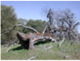
Black oak #41 up on the Arnold, an example of the 11 casualties suffered at Hastings since it was invaded in 1980. (We'll find those WMDs eventually, I'm sure.) This big guy fell following the 2001 insurgent attack, a good year in which we counted

Combining all 28 individuals, the results are thus far not exactly ironclad but the direction is pretty clear: trees that are about to die are likely to produce fewer, not more, acorns than those that are not. Of the 28 trees, 21 produced fewer acorns the last year of their life than the average conspecific at the same site, a difference that was even more pronounced (and actually significant) the year prior to their last year, when 22 of 27 trees produced fewer acorns than the mean conspecific at the same site. Even more dramatically is their subsequent productivity: absolutely none of the 28 trees produced more than the mean number of acorns after they died! Trends are basically the same for valley/blue oaks and for black oaks when separated out, although sample sizes are proverbially low.